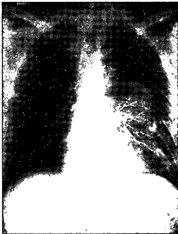
Fig. 1.—Roentgenogram showing pneumothorax and Lipiodol bronchogram. The pneumothorax was accidentally induced when a thoracentesis was performed.