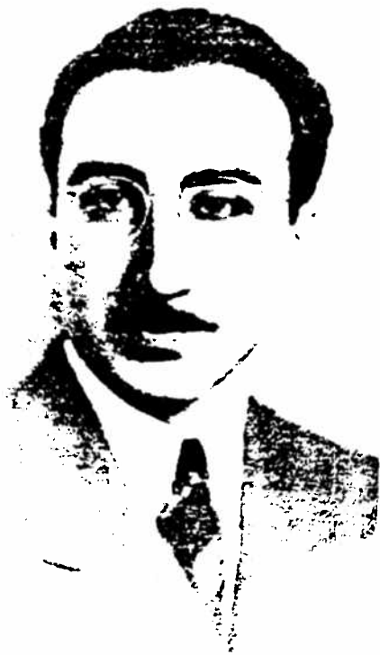
Fig. 10. Dr. Michael DeBakey.